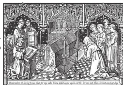
MASS OF CHRISTIAN BURIAL

Going forward, when there is a funeral scheduled on Thursday, the normal 10 am Mass, along with Eucharistic Adoration and Reconciliation, will be cancelled. All funeral Masses will