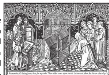
MASS OF CHRISTIAN BURIAL

Going forward, when there is a funeral scheduled on Thursday, the normal 10:00 Mass, along with Eucharistic Adoration and Reconciliation, will be cancelled. All funeral Masses will be at 11:00 to better accommodate the families. We will remind everyone through weekend announcements and/or Flocknote.