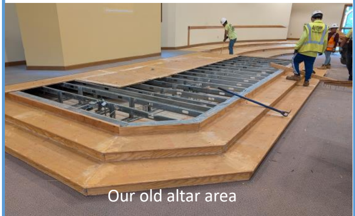
Our old altar area

Noisy activity is all around—inside and out! There has already been quite a lot of demolition. All parishioners are respectfully reminded that the main floor and the church's outside perimeter are restricted access work areas. The only access to the building is through the lower level. Please limit your visits to the church property to essential matters. Call 540-297-5530.