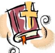
Faith Formation Registration